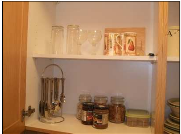
Interior of Kitchen unit.