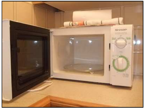
Sharp microwave oven