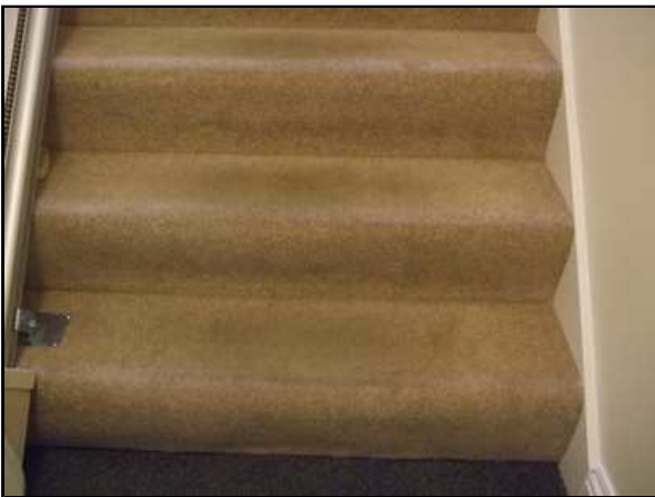
Grubby carpet to lower treads of Hall stairs.