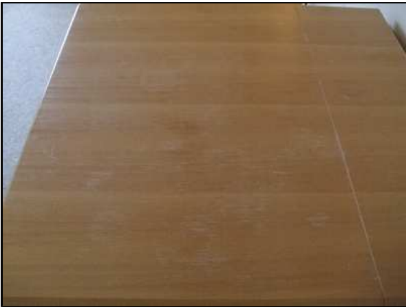
Water marked and scatched dining table top.