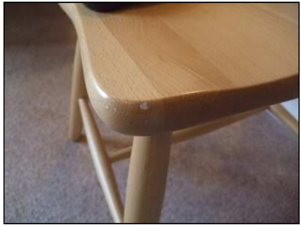
Paint splash to dining chair.