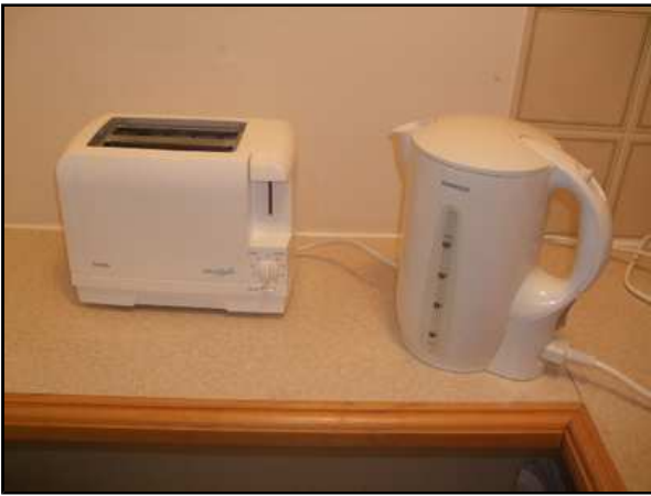
Hinari toaster and Kenwood kettle