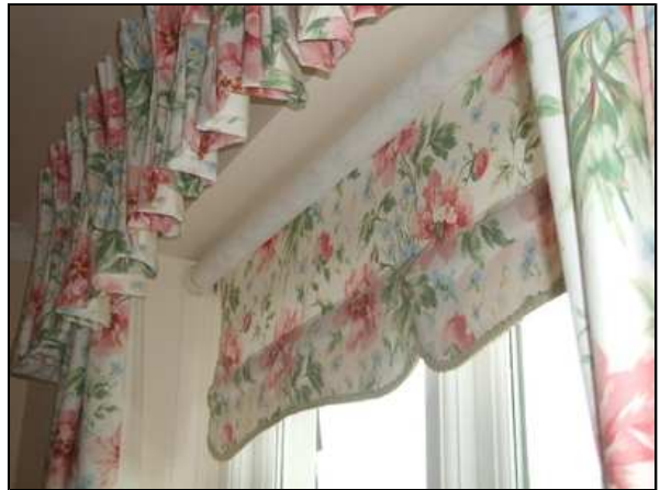
Curtains, Pelmet and Blind

Signed ..... Date ..... Visitors Flat, Northfield Court, St Peters Road, Aldeburgh, Suffolk IP15 5LU