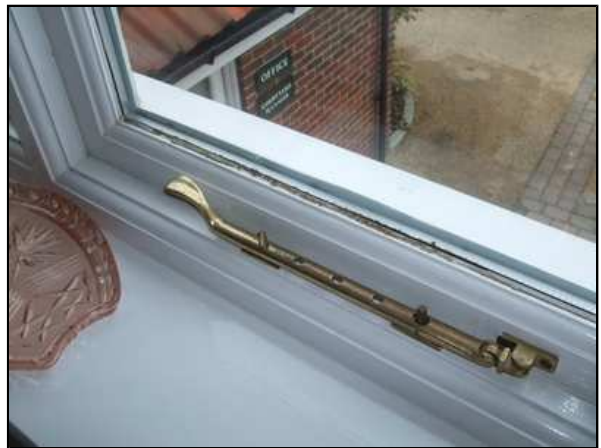
Mould to internal window glazing.

Signed ..... Date ..... Visitors Flat, Northfield Court, St Peters Road, Aldeburgh, Suffolk IP15 5LU