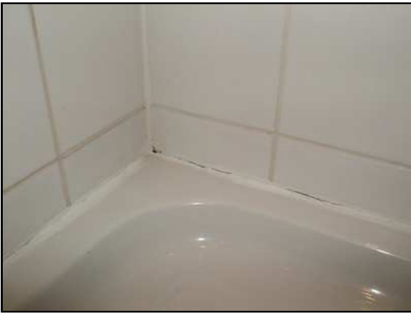
Black mould and damaged shower tray mastic seals.